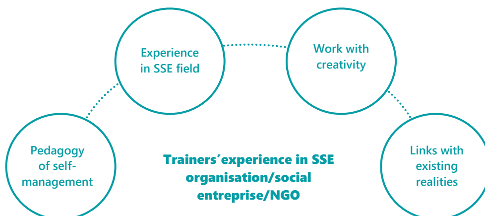
Graphic 2: Trainers' experience on SSE organisation/social enterprise/NGO

Participants at the survey mentioned with great importance that trainers: